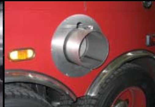
Side dumps between tandem axles

These are the typical specifications for the Liberty™ Tanker by American LaFrance: