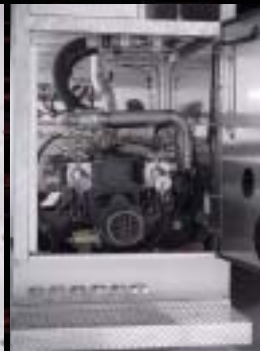
Full access to pump house