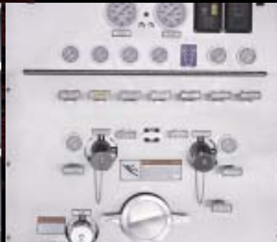
Aluminum pump house with stainless steel panels