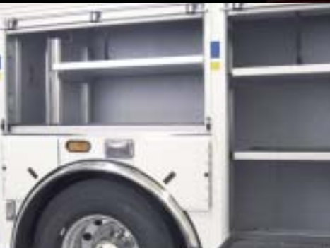
Zolatone compartment finish